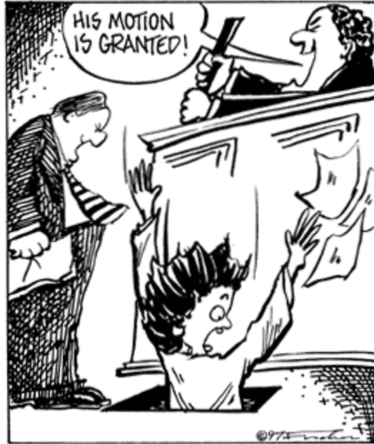
MOTION FOR SUMMARY JUDGMENT